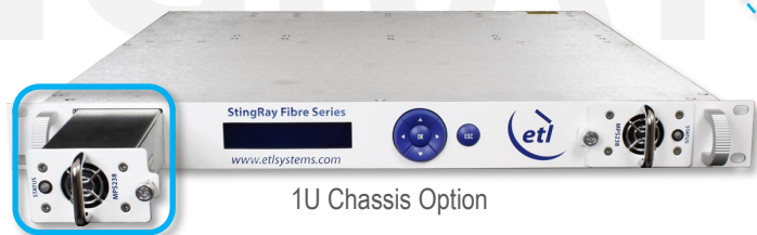
1U Chassis Option

Local control & monitoring via front panel push buttons & display